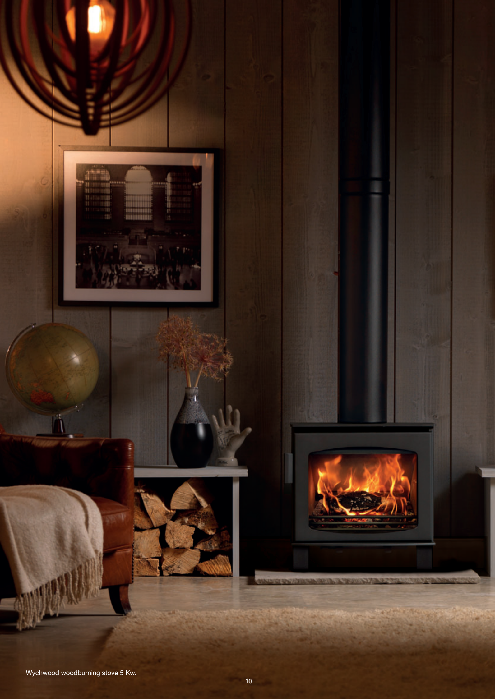
Wychwood woodburning stove 5 Kw.